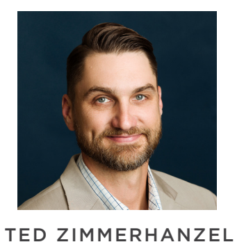
VICE PRESIDENT PRECONSTRUCTION GUIDO CONSTRUCTION